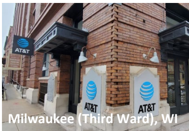
Milwaukee (Third Ward), WI