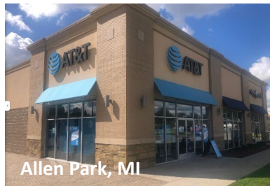
Allen Park, MI